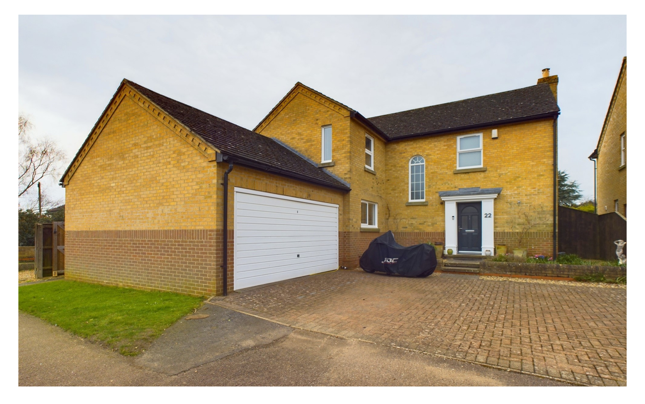
Margett Street, Cottenham CB24 8QY