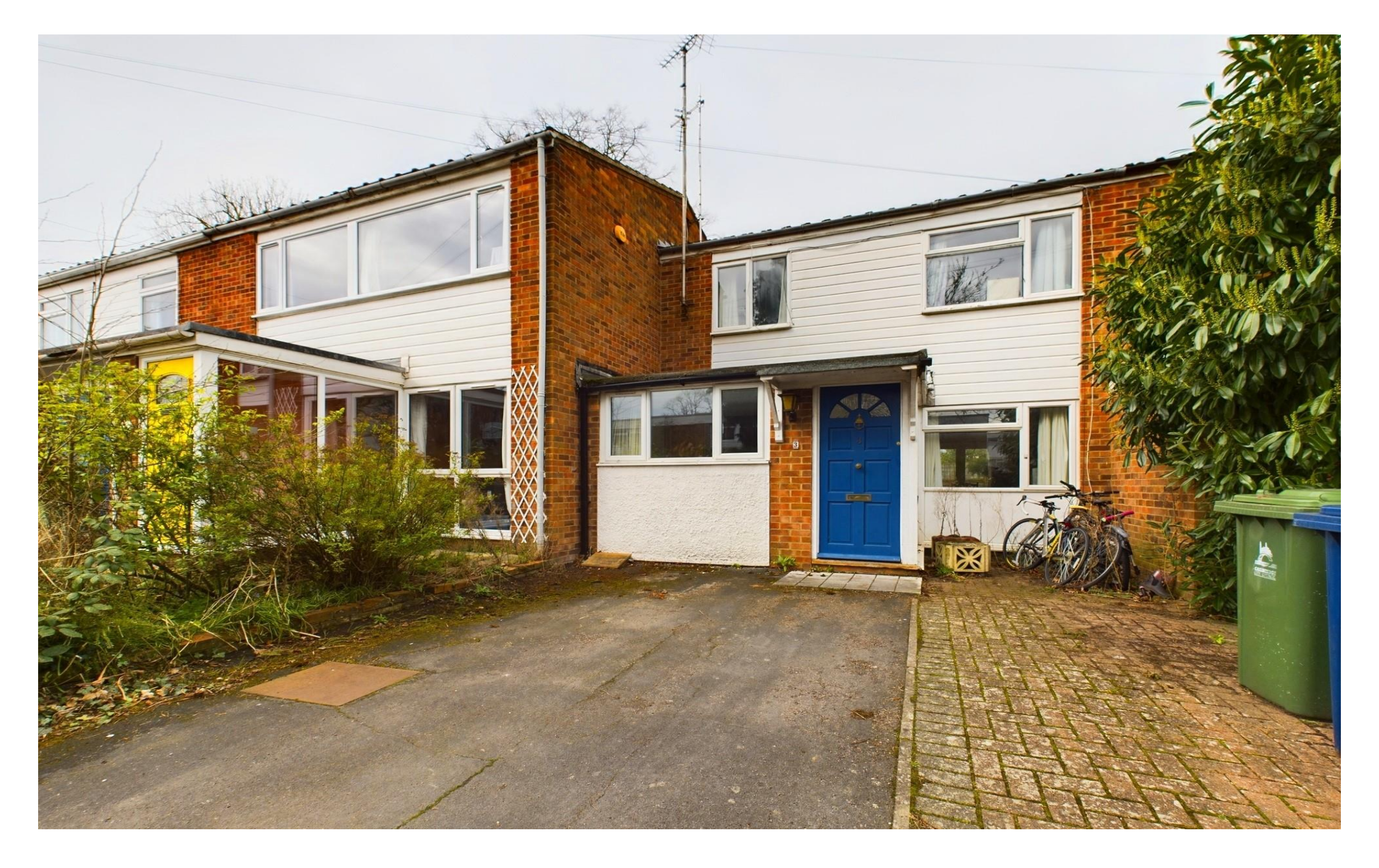
Kirkby Close, Cambridge CB4 1XP