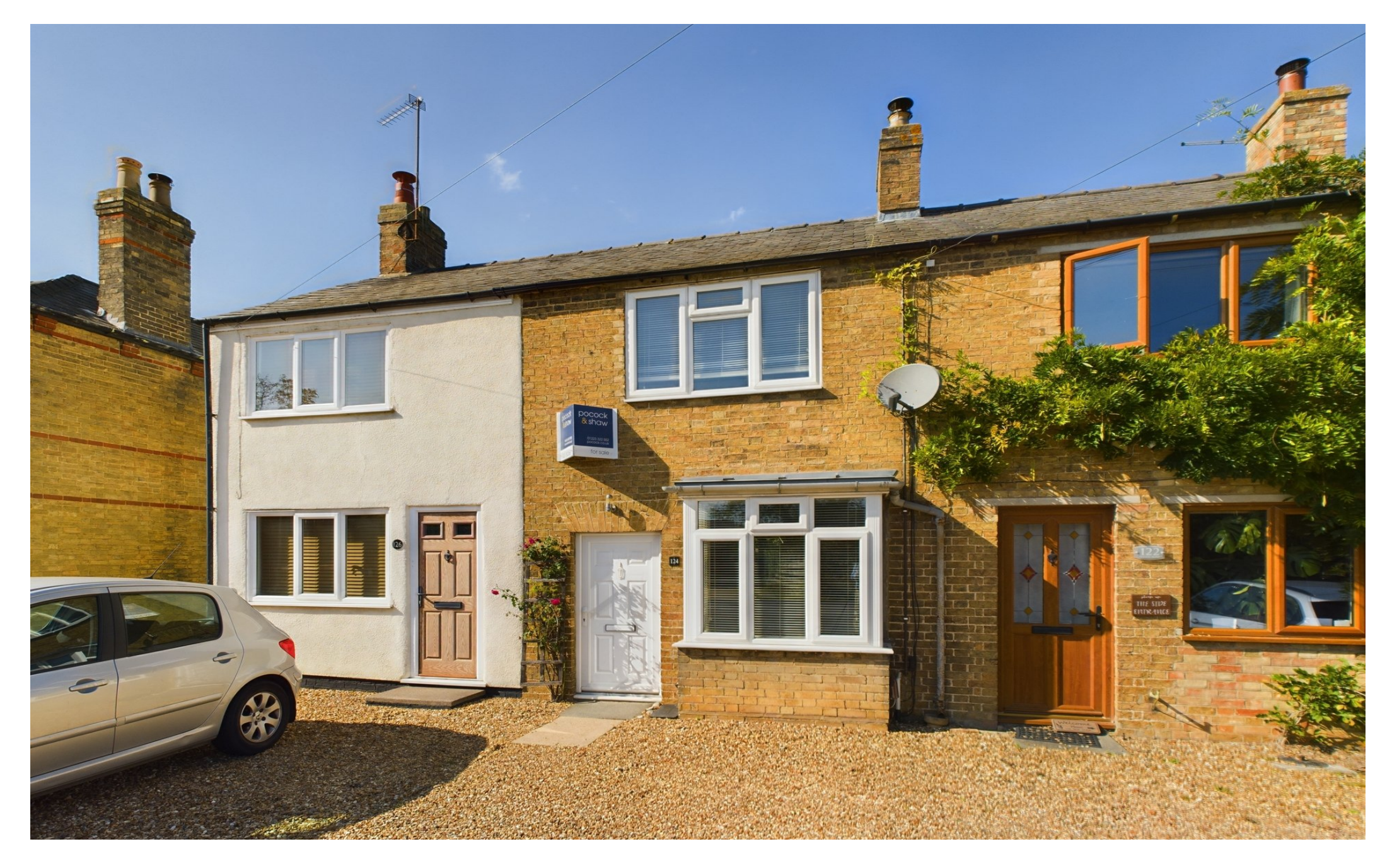
Histon Road, Cottenham CB24 8UG