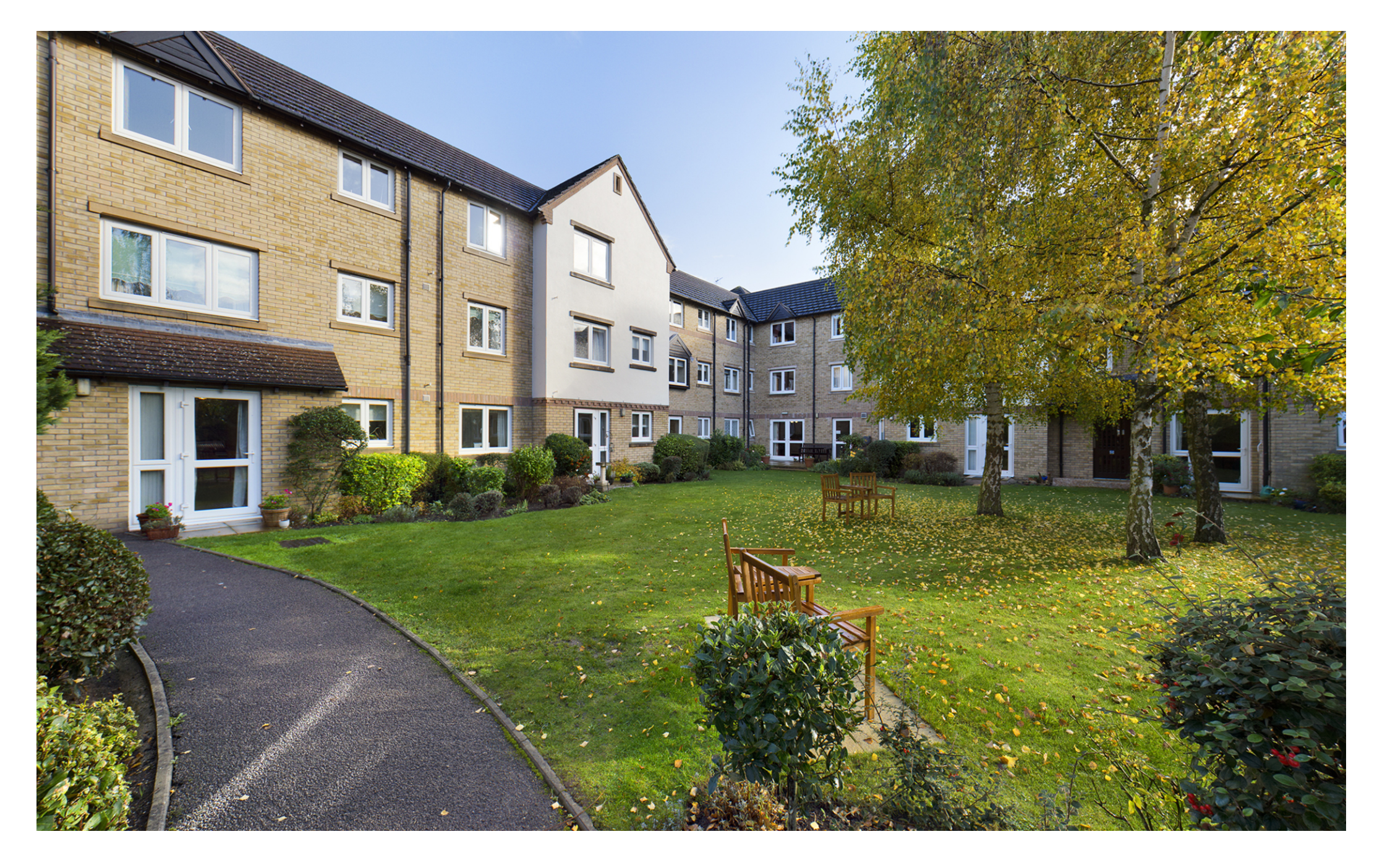
Haig Court, Cambridge CB4 1TT