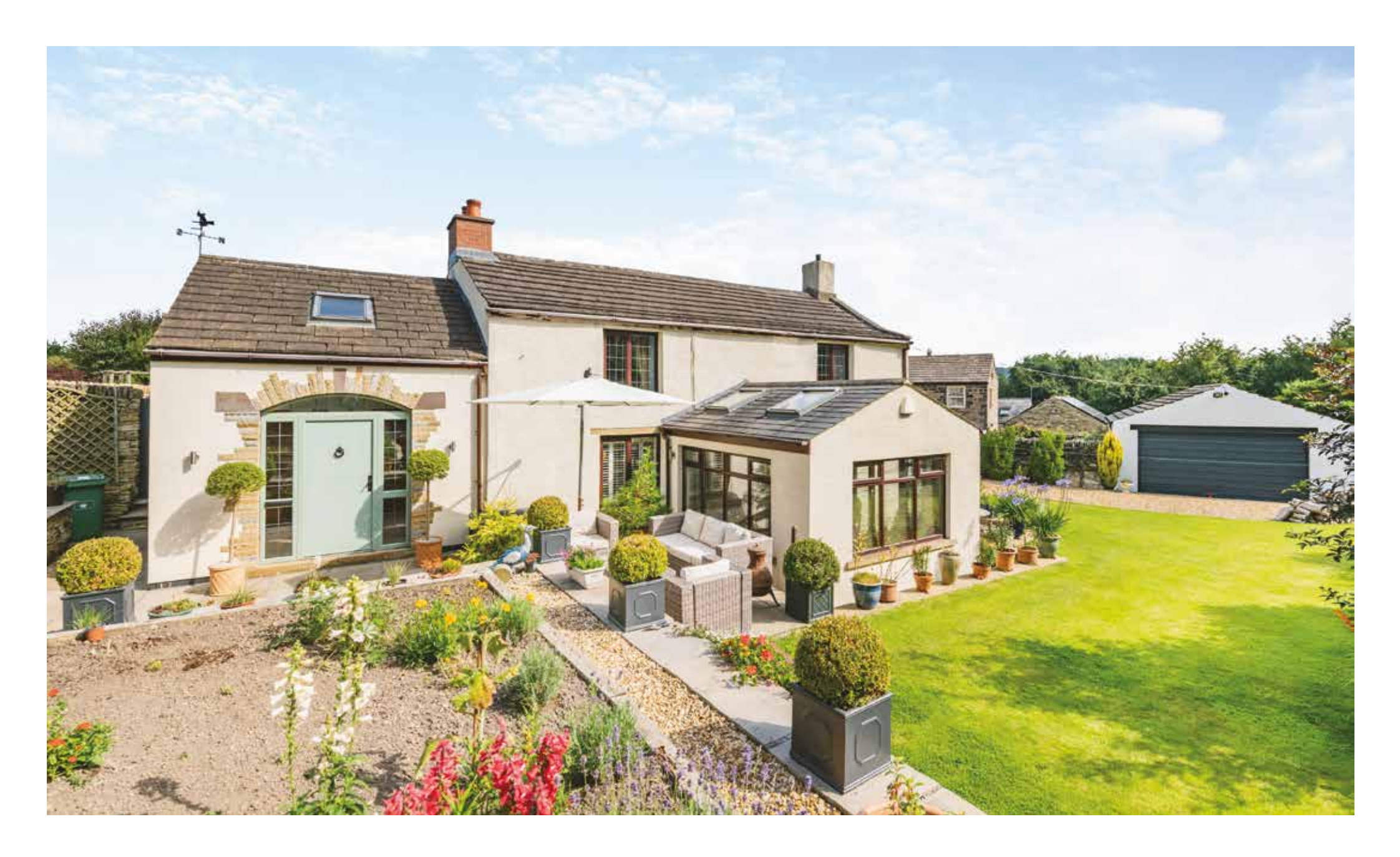
Pinfold Farm 4 Town End Lane | Lepton | Huddersfield | West Yorkshire | HD8 0NA