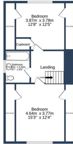
1ST FLOOR 58.5 sq.m. (630 sq.ft.) approx.

ST JOHN'S PARK, ALDBROUGH ST JOHN. DL11 7TW.