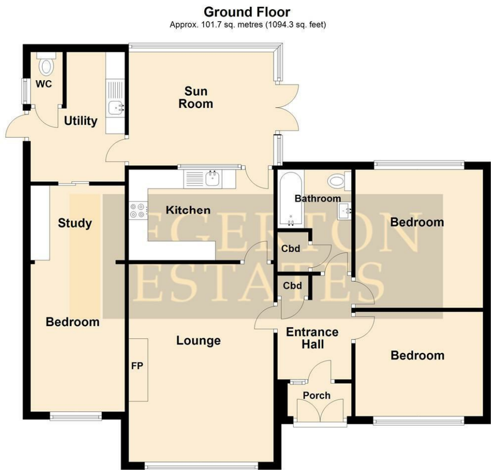
Total area: approx. 101.7 sq. metres (1094.3 sq. feet)

This floor plan is for illustrative purposes only and may not be representative of the property. The measurements are approximate and are for illustrative purposes only. Plan produced using PlanUp.