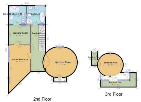
For illustrative purposes only - Not to scale