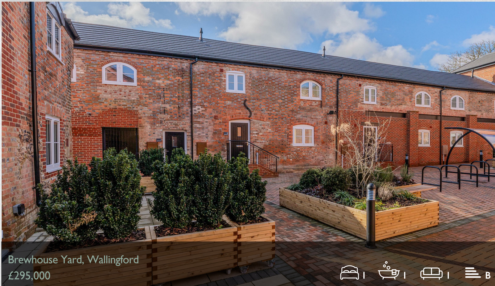
Brewhouse Yard, Wallingford £295,000