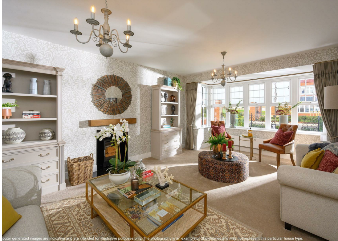
Computer generated images are indicative and are intended for illustrative purposes only. The photography is an example of Showhomes and may not represent this particular house type.

Welcome to 'The Wisteria'... These executive detached four-bedroom properties are available from 2023 and boast a wealth of high end features and stylish interiors. Located just a short stroll from Wallingford town and surrounded by over 18 acres of green open space, The Wisteria features an open plan kitchen/diner/family room, a cosy lounge complete with log burner and four double bedrooms with two en-suites and a family bathroom. To the outside space, the enclosed rear garden provides a relaxing setting to enjoy and with both garage and off-street parking, these stunning properties are houses you'd be proud to call home. Call In House for more information and to register your interest.