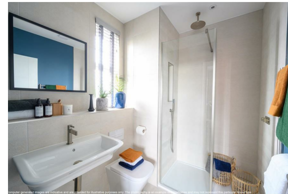
Computer generated images are indicative and are intended for illustrative purposes only. The photography is an example of Showhomes and may not represent this particular house type.