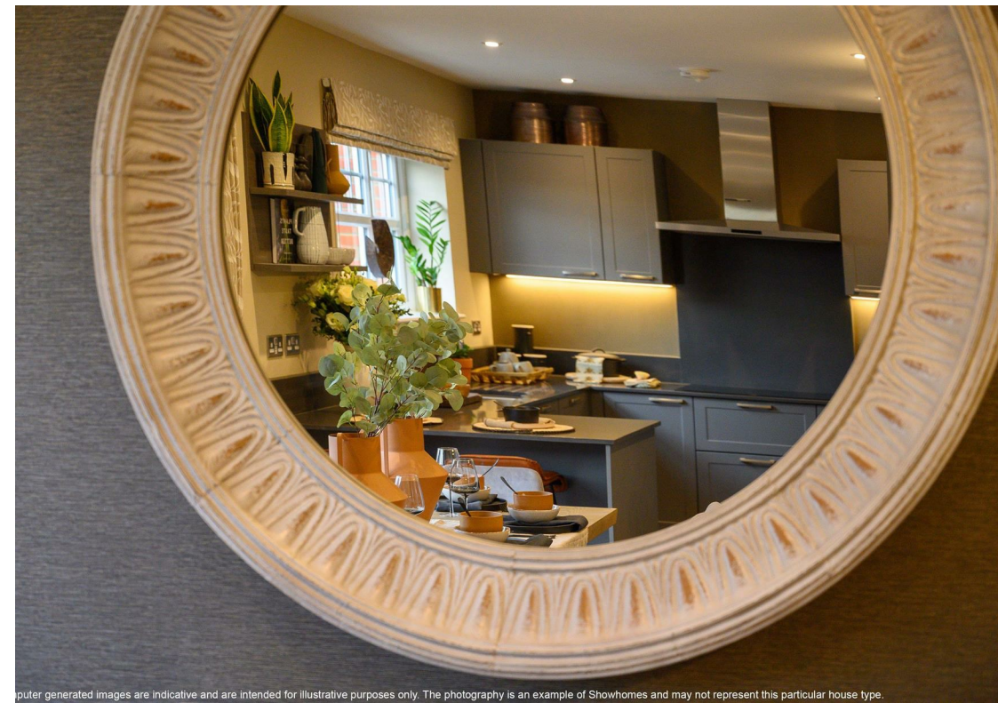
Computer generated images are indicative and are intended for illustrative purposes only. The photography is an example of Showhomes and may not represent this particular house type.