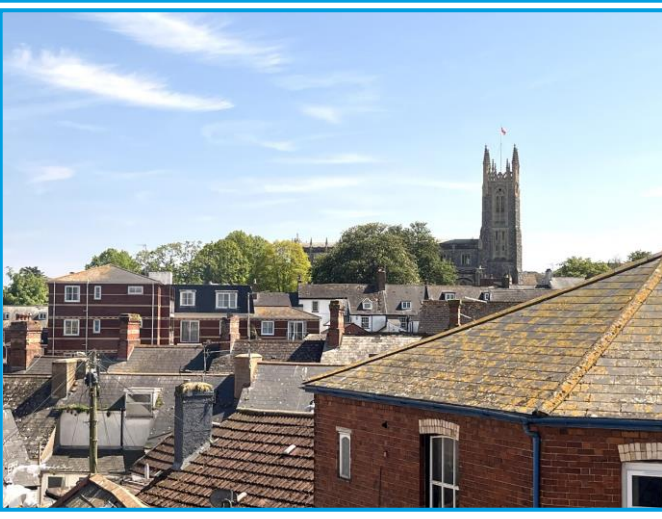
Brand New Penthouse Apartment • Bespoke Development of 19 Individual Apartments Walk To Town, Train Station, Seafront & Marina • Double Glazing & Air Source Heat Pump Electric Heating • 2 Double Bedrooms & Shower Room • Open Plan Living Room / Kitchen • Integrated Kitchen Appliances • 999 Year Lease, Lift Access To All Floors