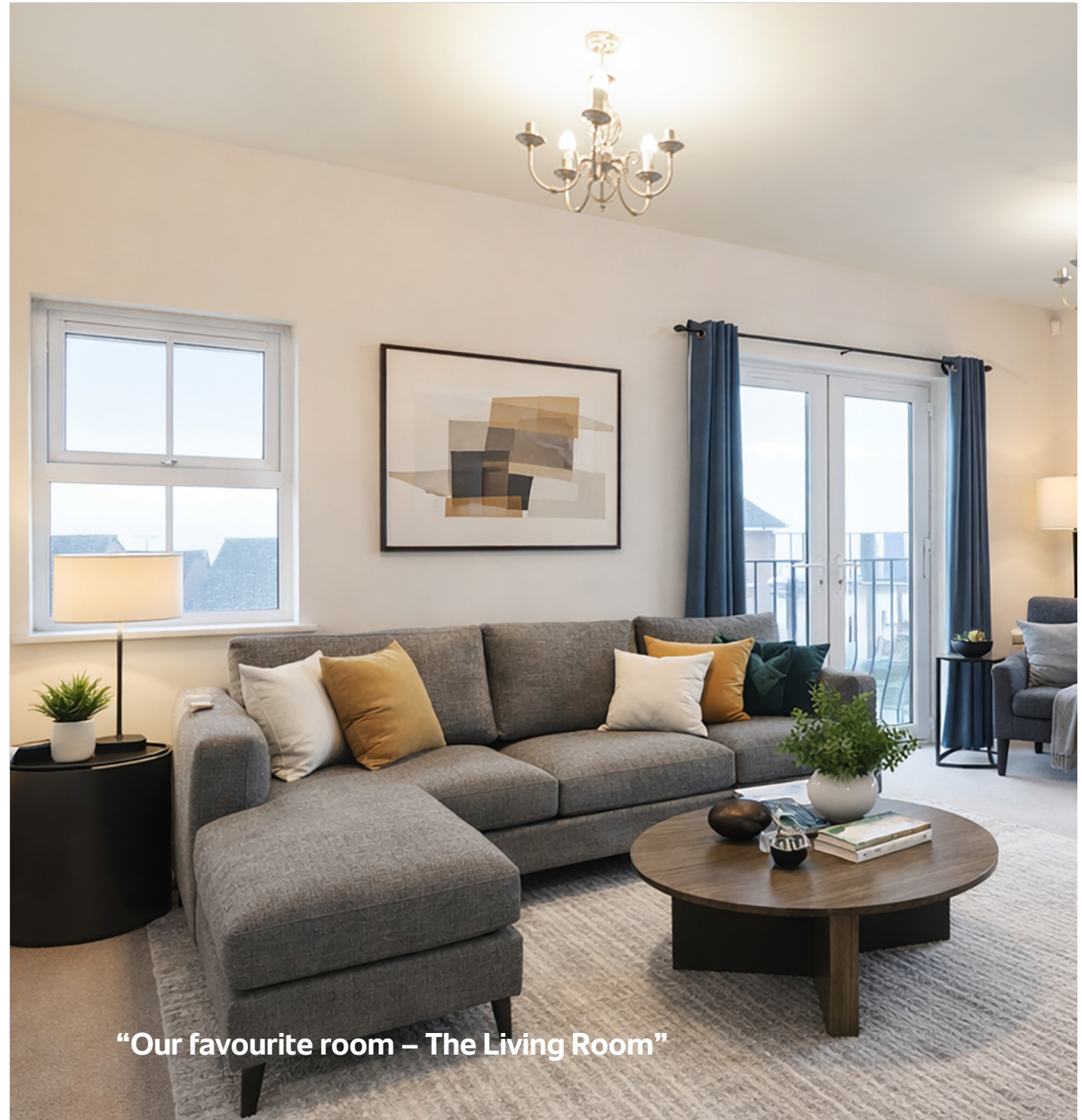
“Our favourite room – The Living Room”

“We love to open the French doors and let the fresh air inside the flat in the summer, it's so nice to have a green space to the front, it gives a very relaxed and calming atmosphere.”