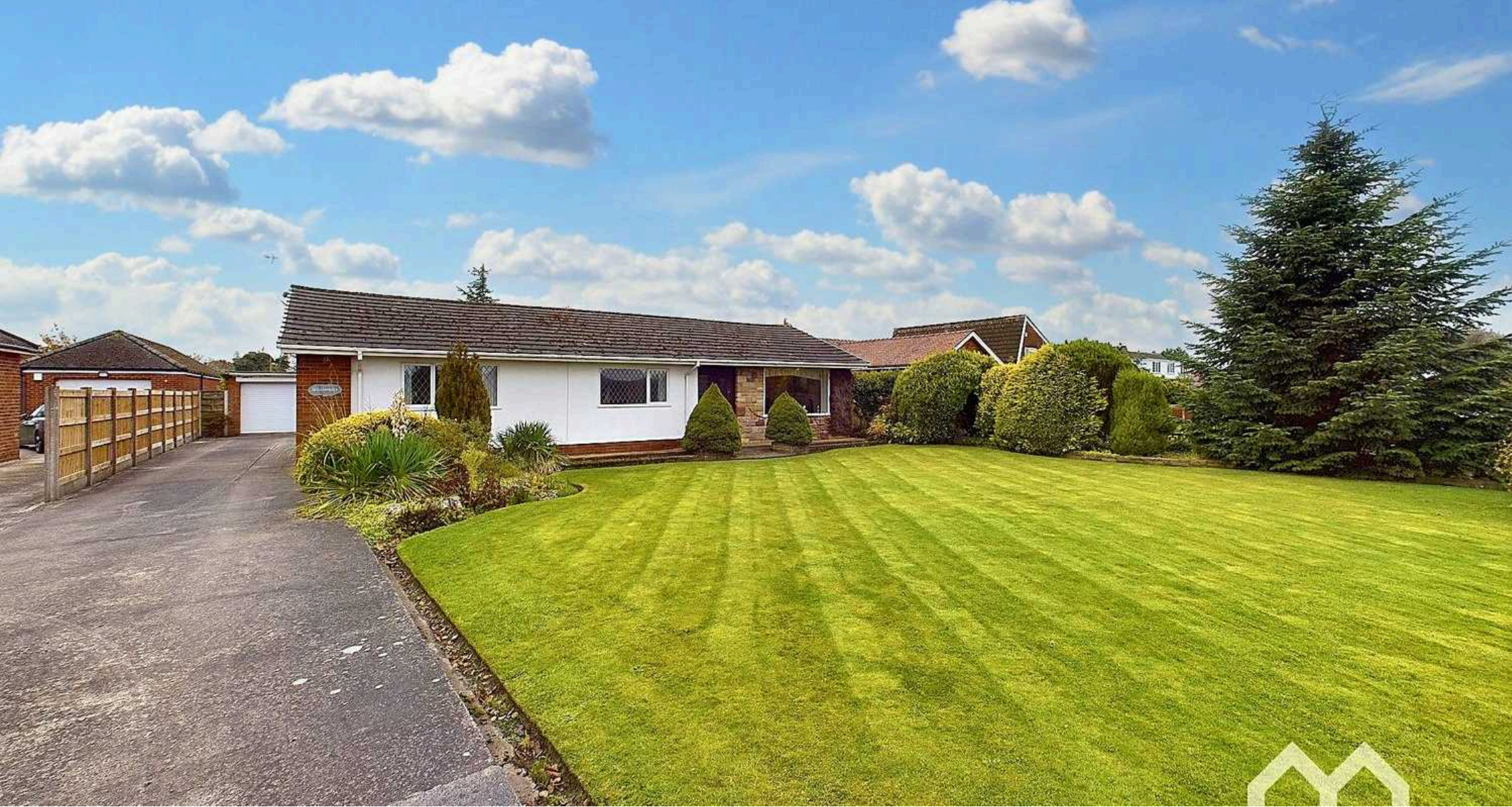
Whiteoaks Gorse Lane, Tarleton Preston