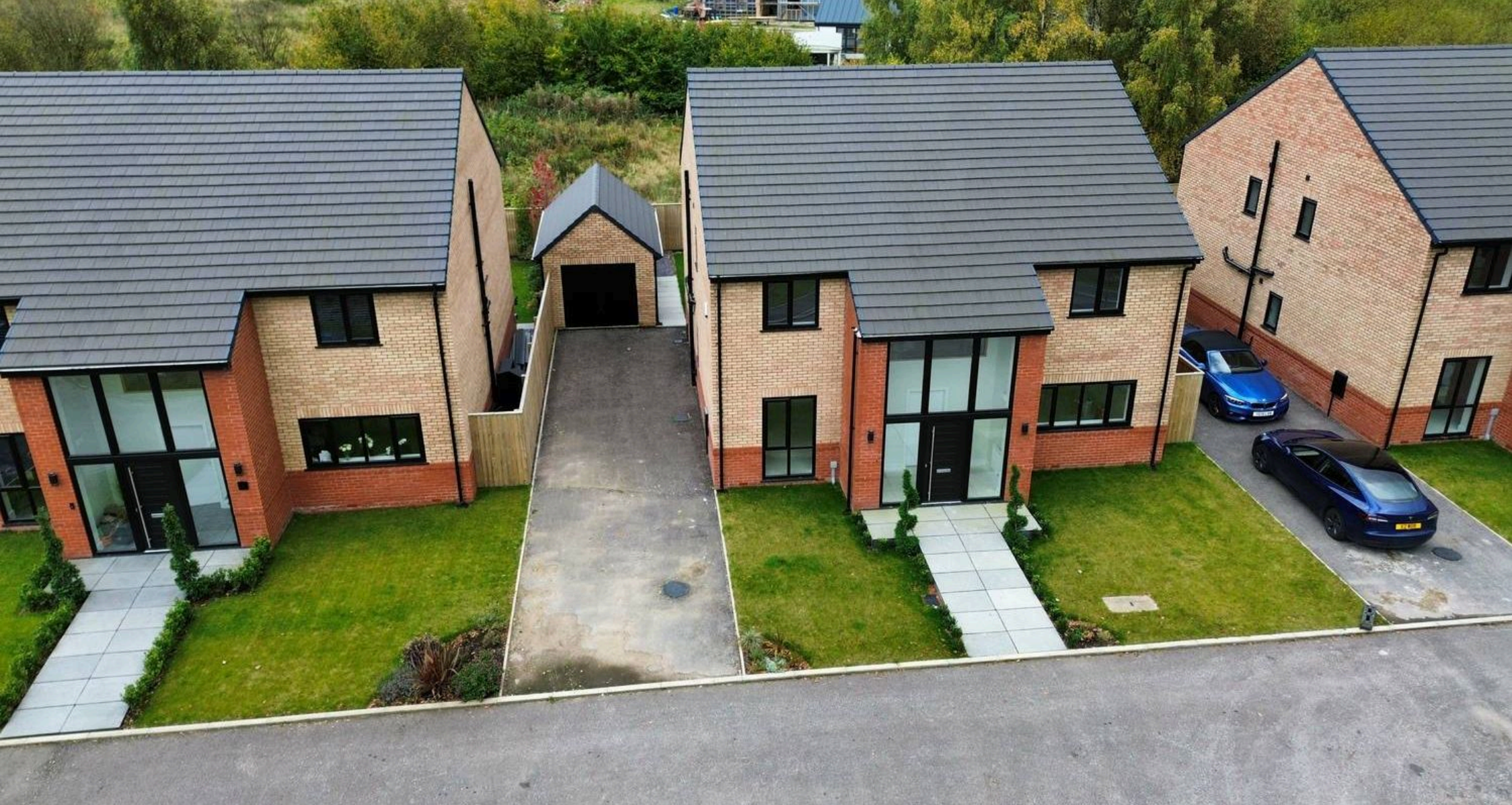
2, Newsham Court, Newsham Hall Lane, Woodplumpton Preston