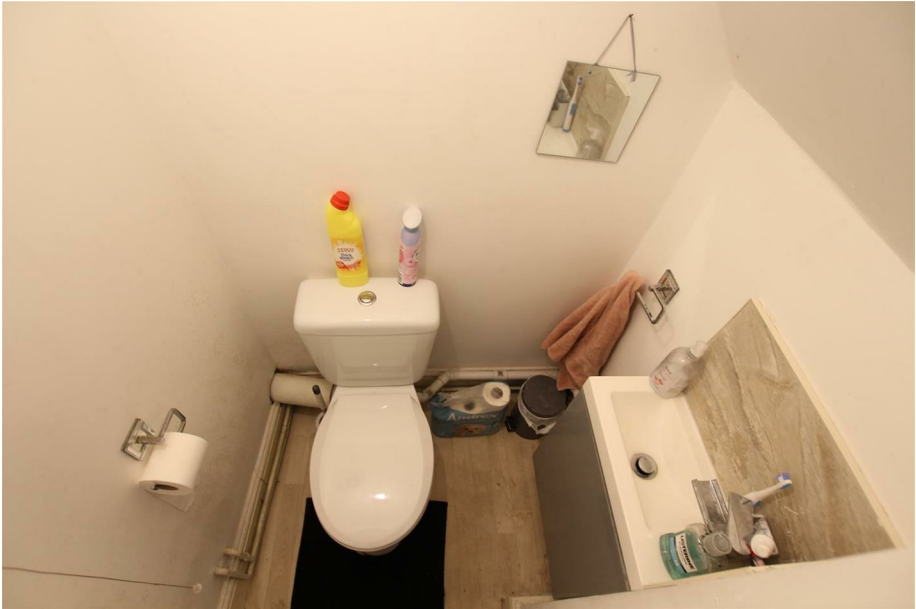
Room Three ensuite toilet