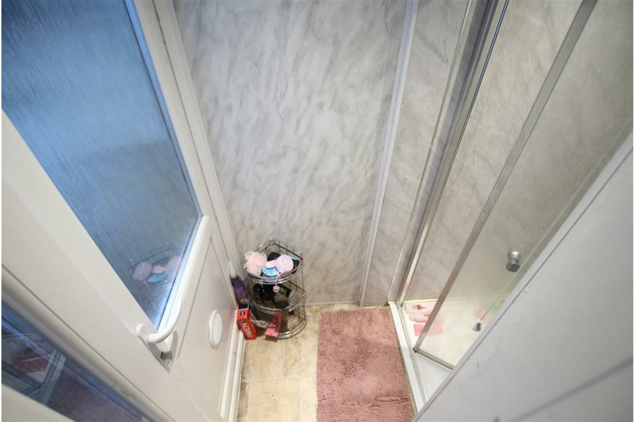
Room Three ensuite shower