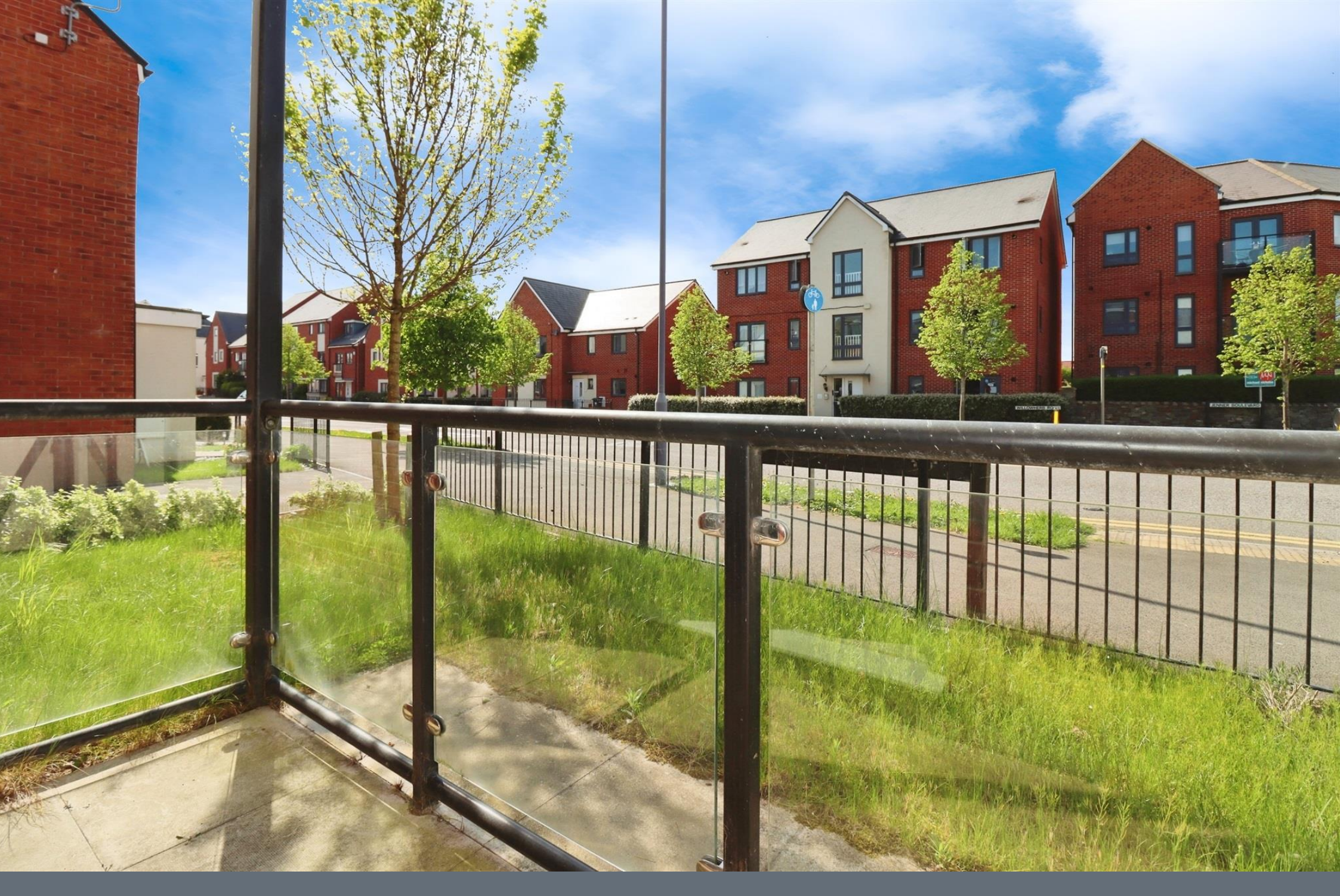
Residential Sales & Lettings | Mortgage Services | Conveyancing | Surveyors | Land & New Homes