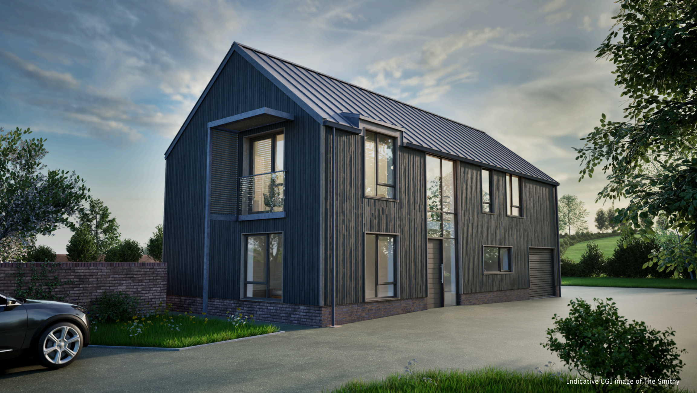
Indicative CGI image of The Smithy