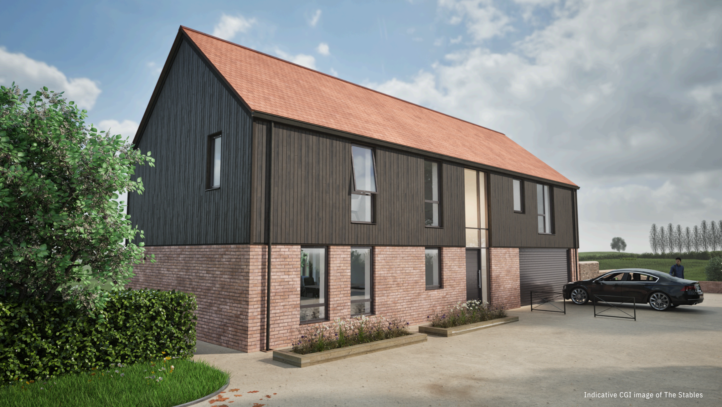
Indicative CGI image of The Stables