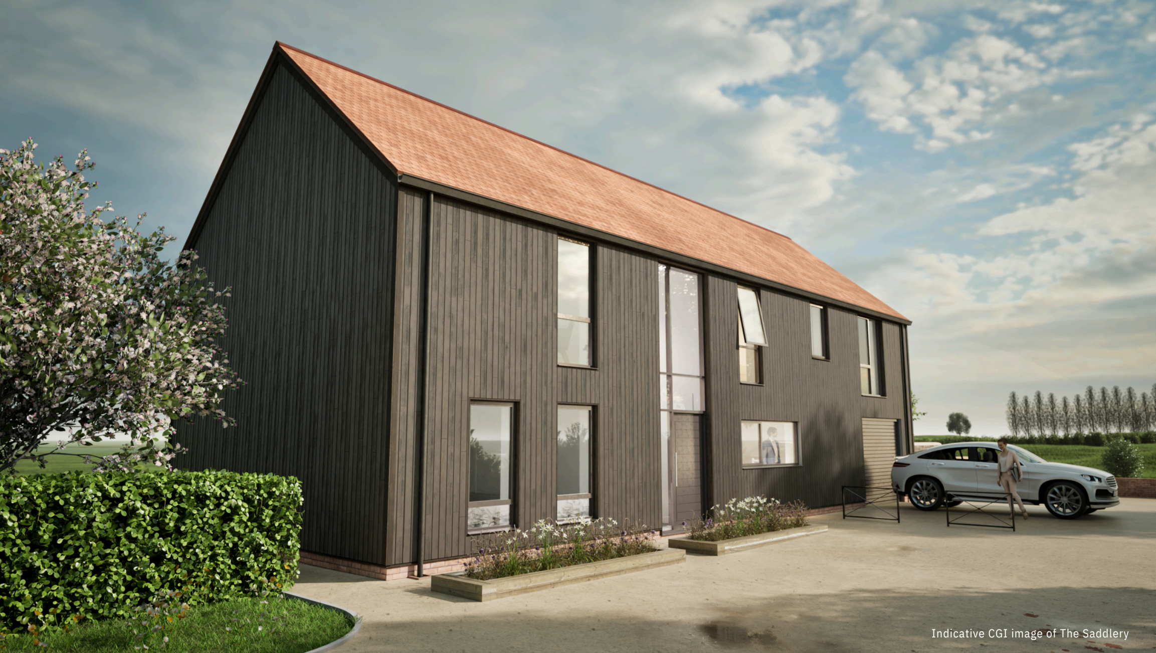
Indicative CGI image of The Saddlery