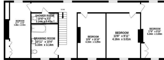
1ST FLOOR 975 sq.ft. (90.6 sq.m.) approx.