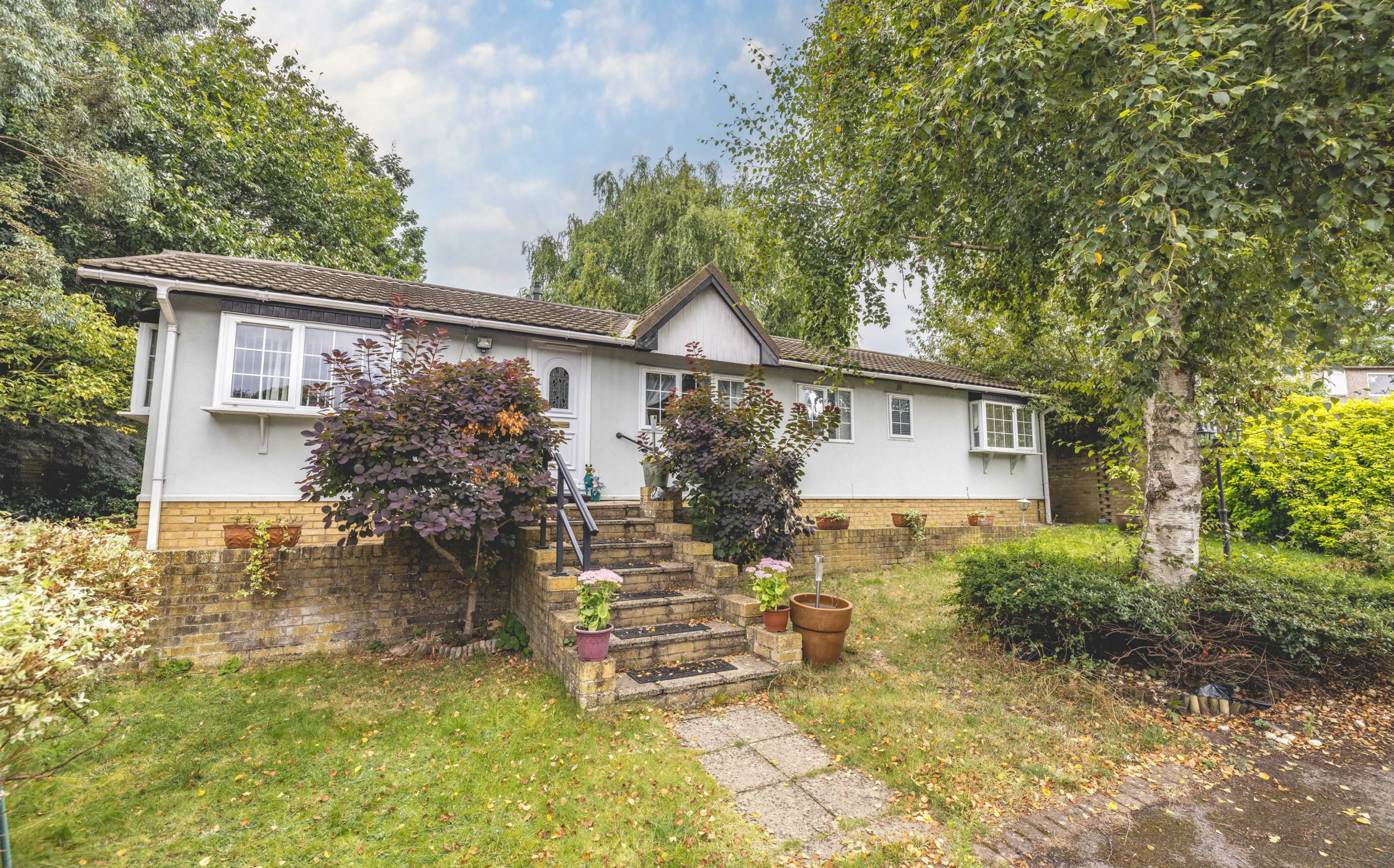
7 Acer Close, Warfield Park, Bracknell, RG42 3RF £360,000