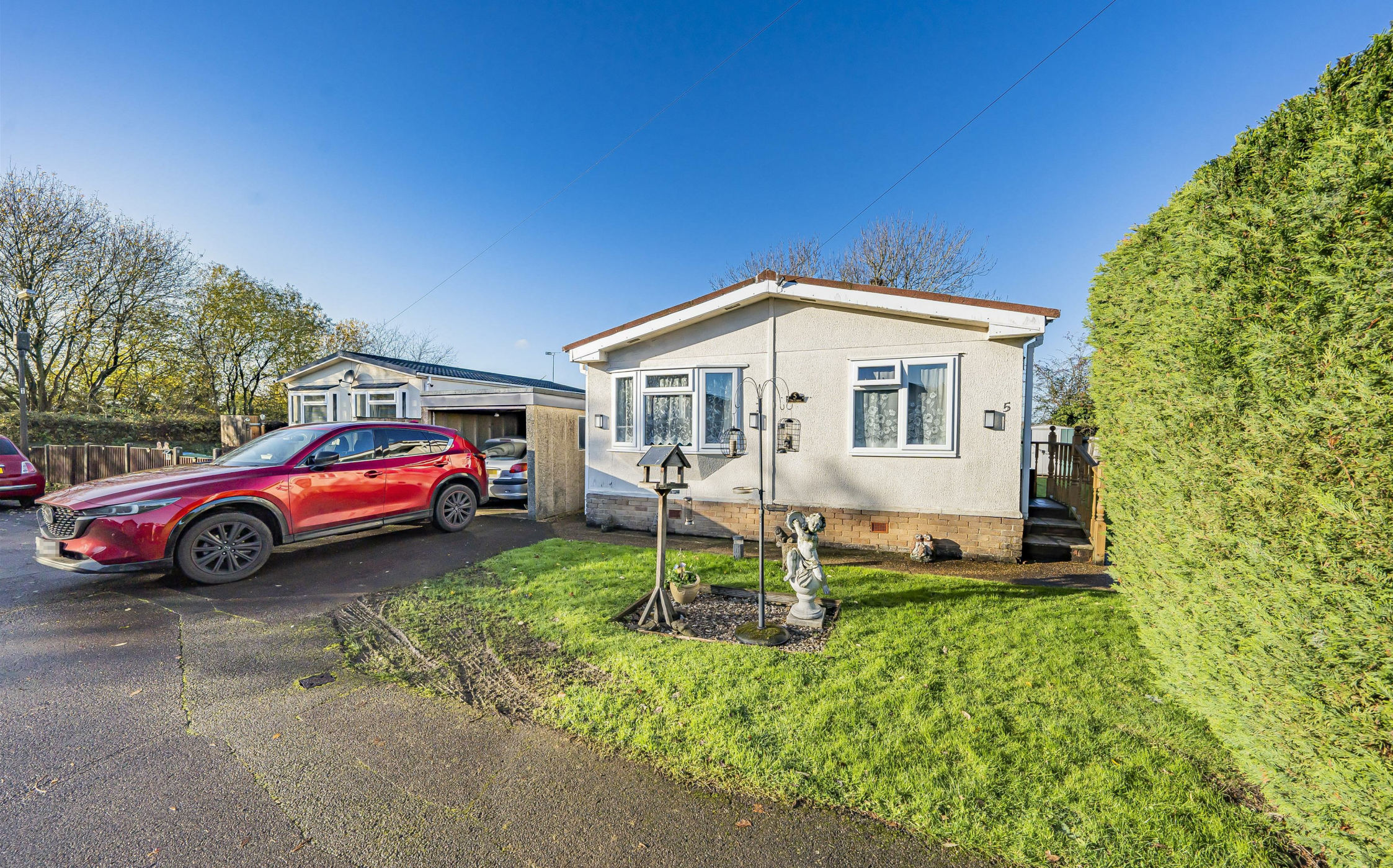
5 The Copse Cranbourne Hall, Winkfield, Windsor, SL4 4UH £200,000