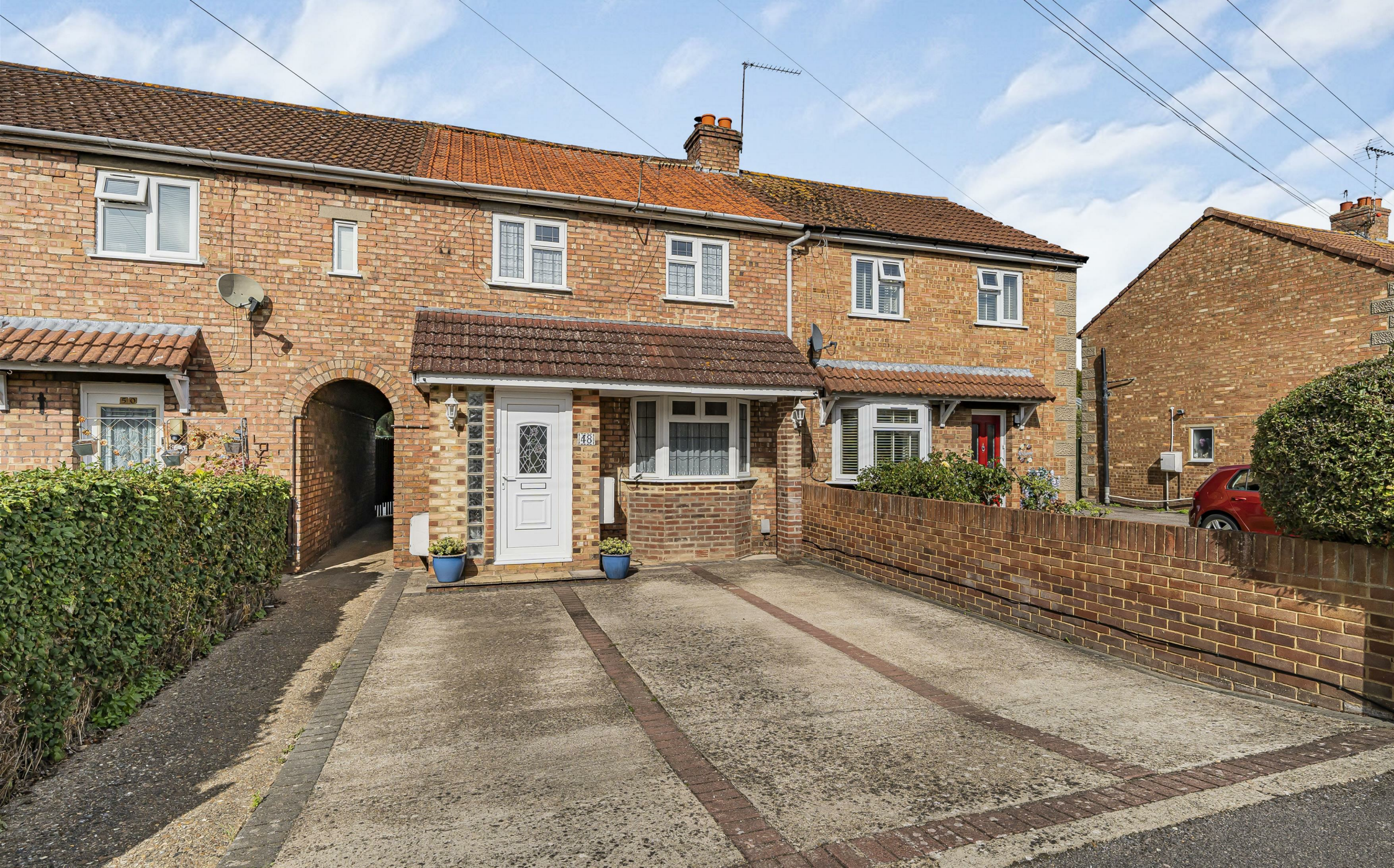
48 East Crescent, Windsor, Berkshire, SL4 5LD £475,000