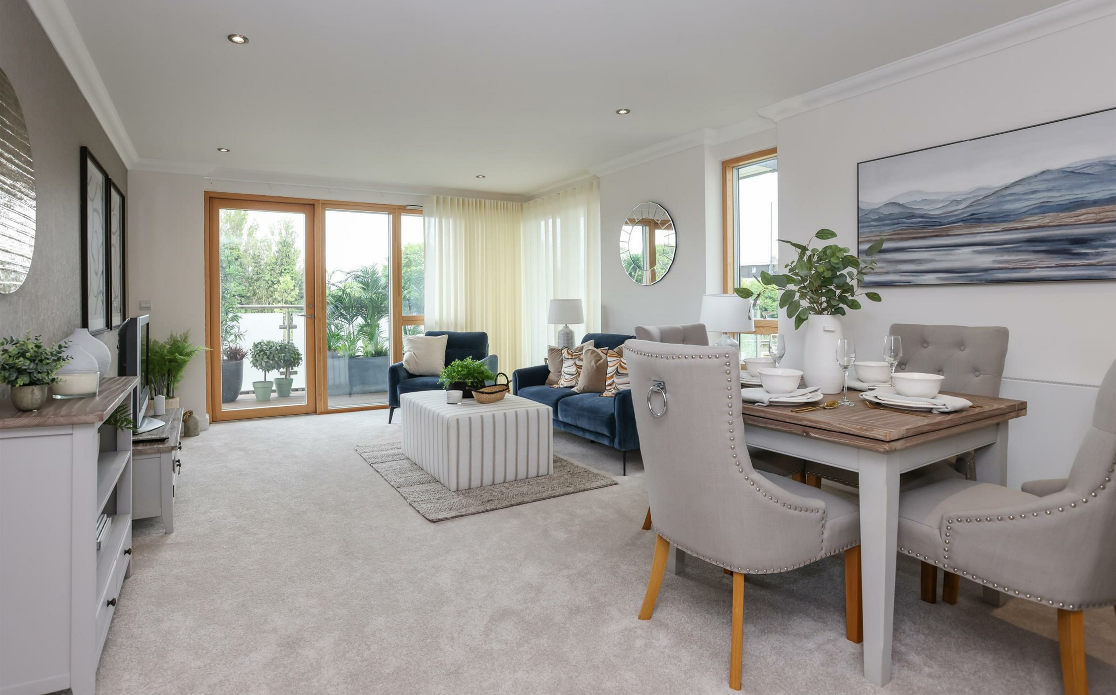
Apartment 22, Castle View Retirement Village Helston Lane, Windsor, SL4 5GG £610,000