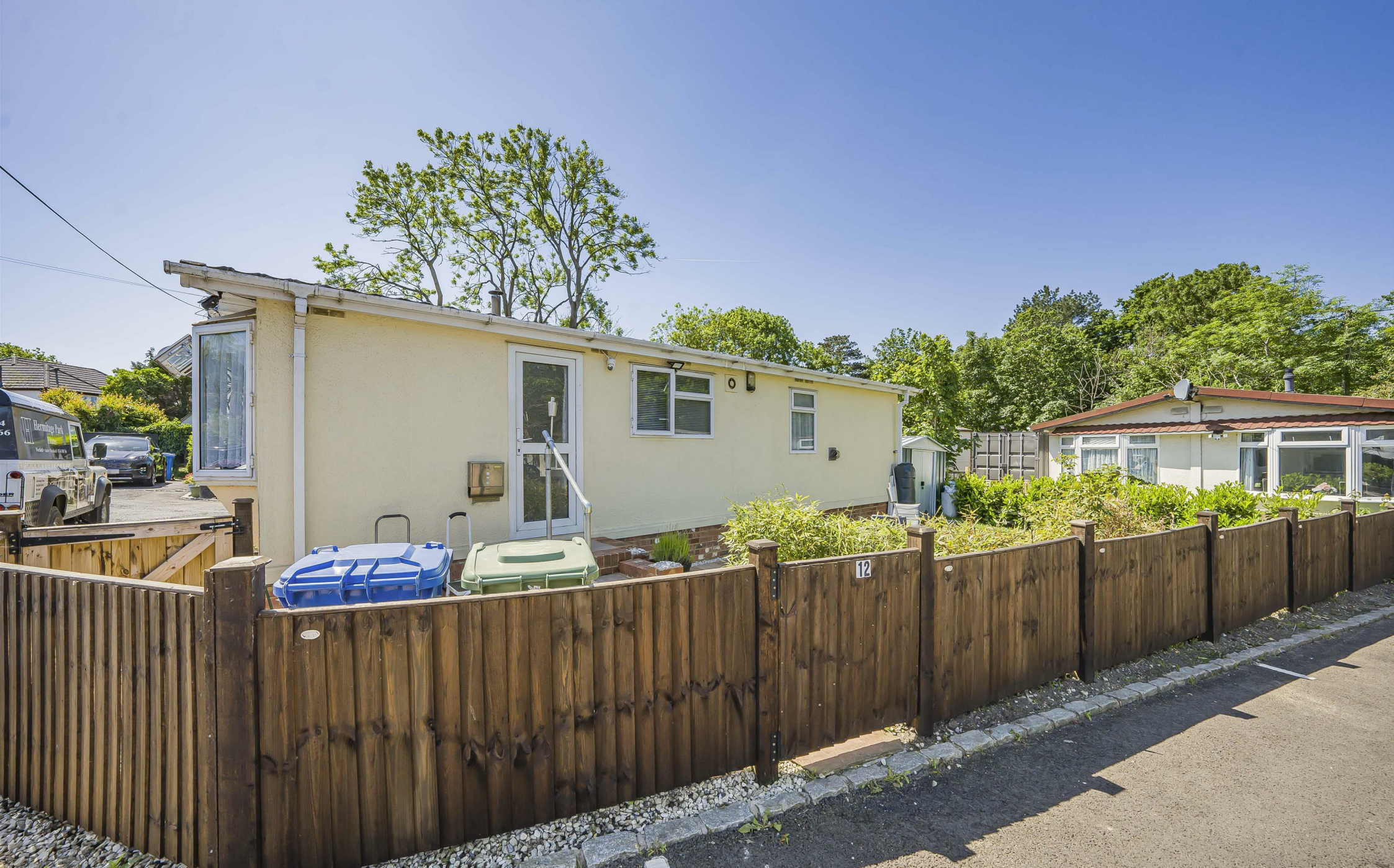
12 the hermitage Warfield Street, Warfield, Berkshire, RG42 6AS £137,500