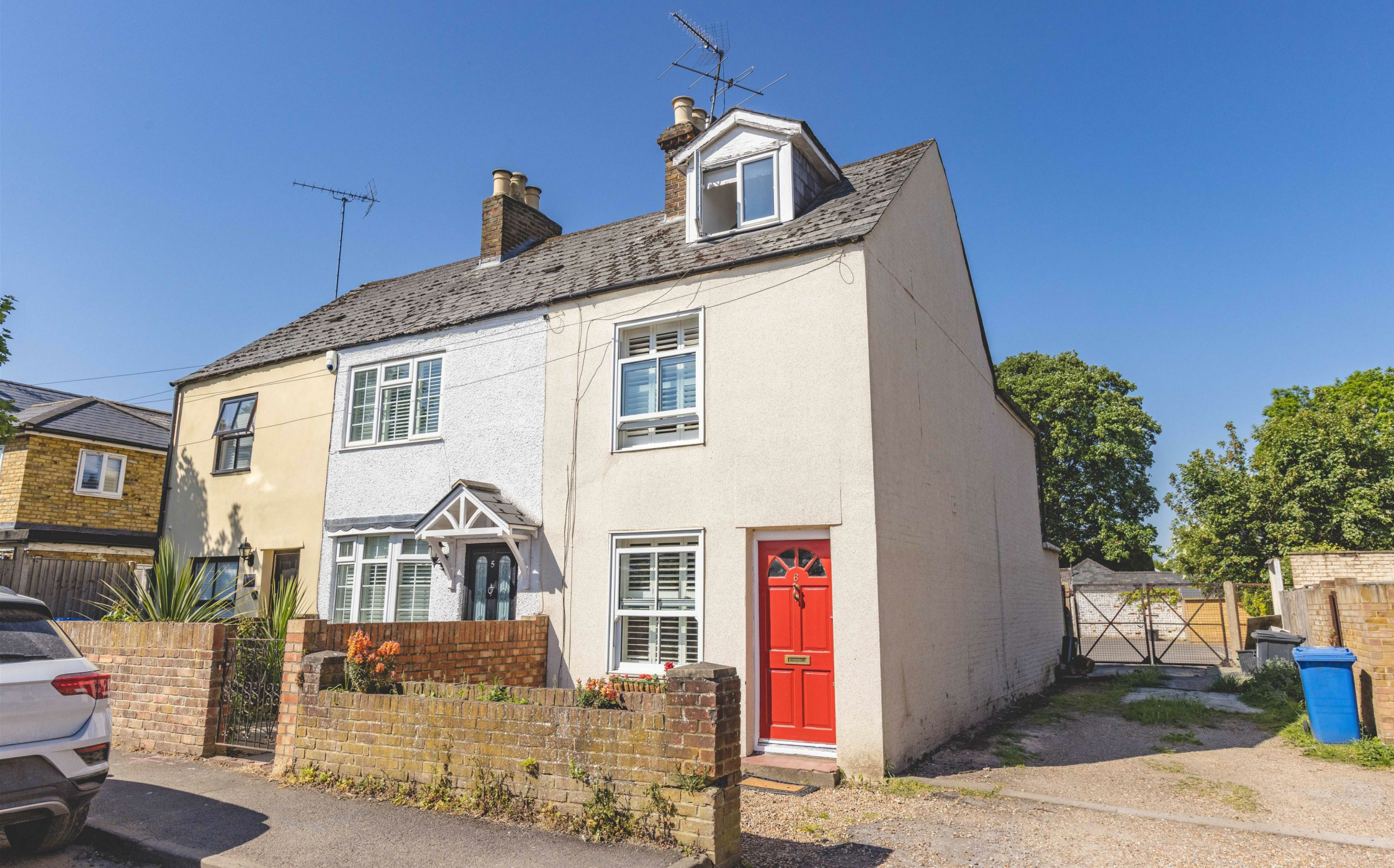
6 Beaumont Cottage Oxford Road, Windsor, SL4 5DY £475,000