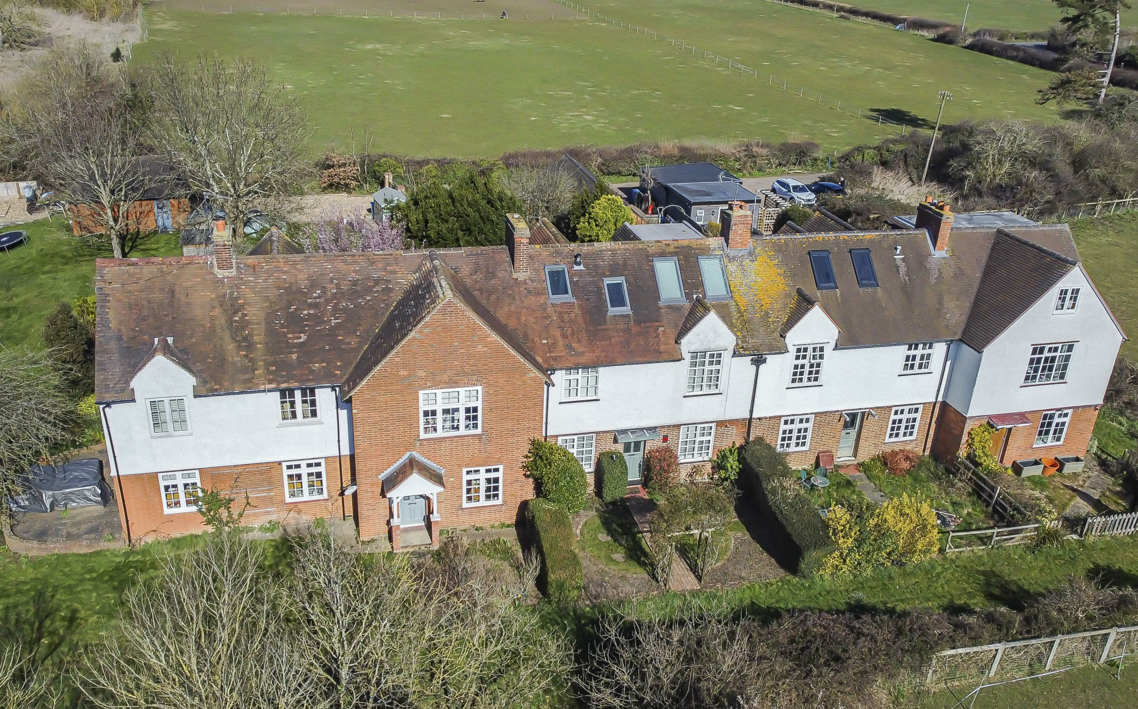
2 Manor Cottages Ham Lane, Old Windsor, Windsor, SL4 2JR Offers in excess of £799,950