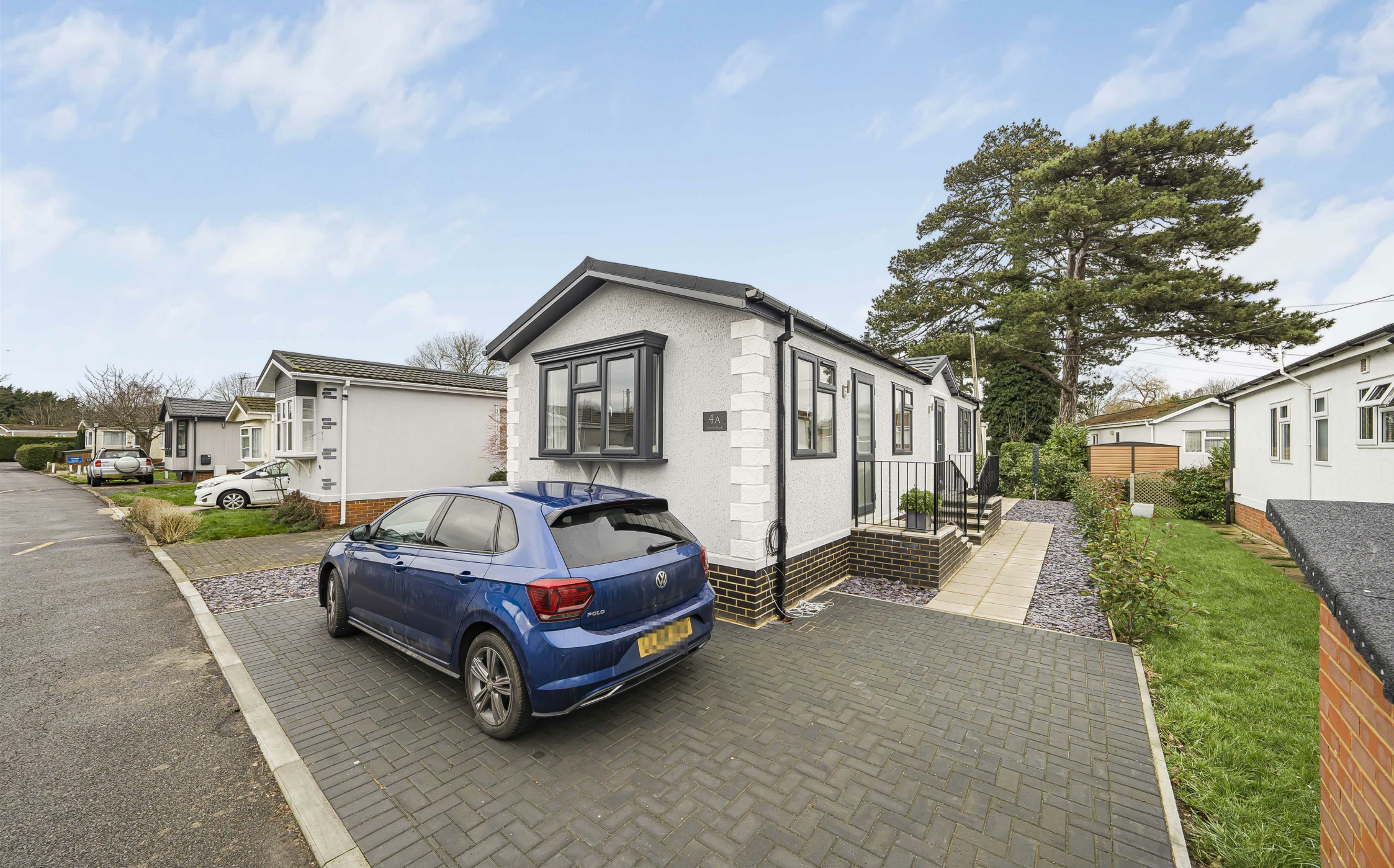
4a Centre Road Willows Riverside Park, Windsor, SL4 5TU £225,000