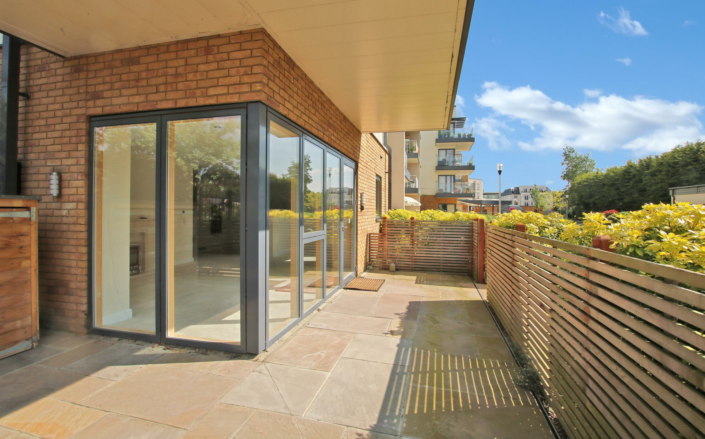
Apt 6 Castle View Helston Lane, Windsor, SL4 5GG £450,000