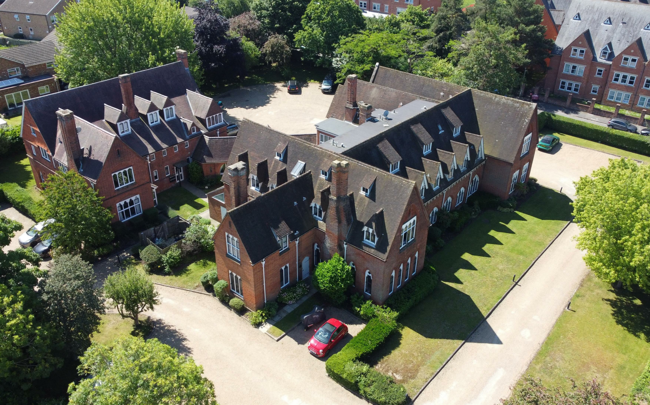
6 West Wing, Recognition House. Bridgeman Drive, Windsor, SL4 3TD Guide price £399,950