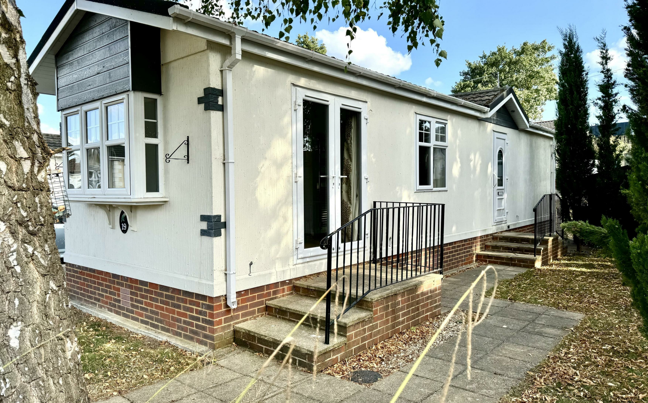
19 Main Road Willows Riverside Park, Windsor, SL4 5TS £160,000