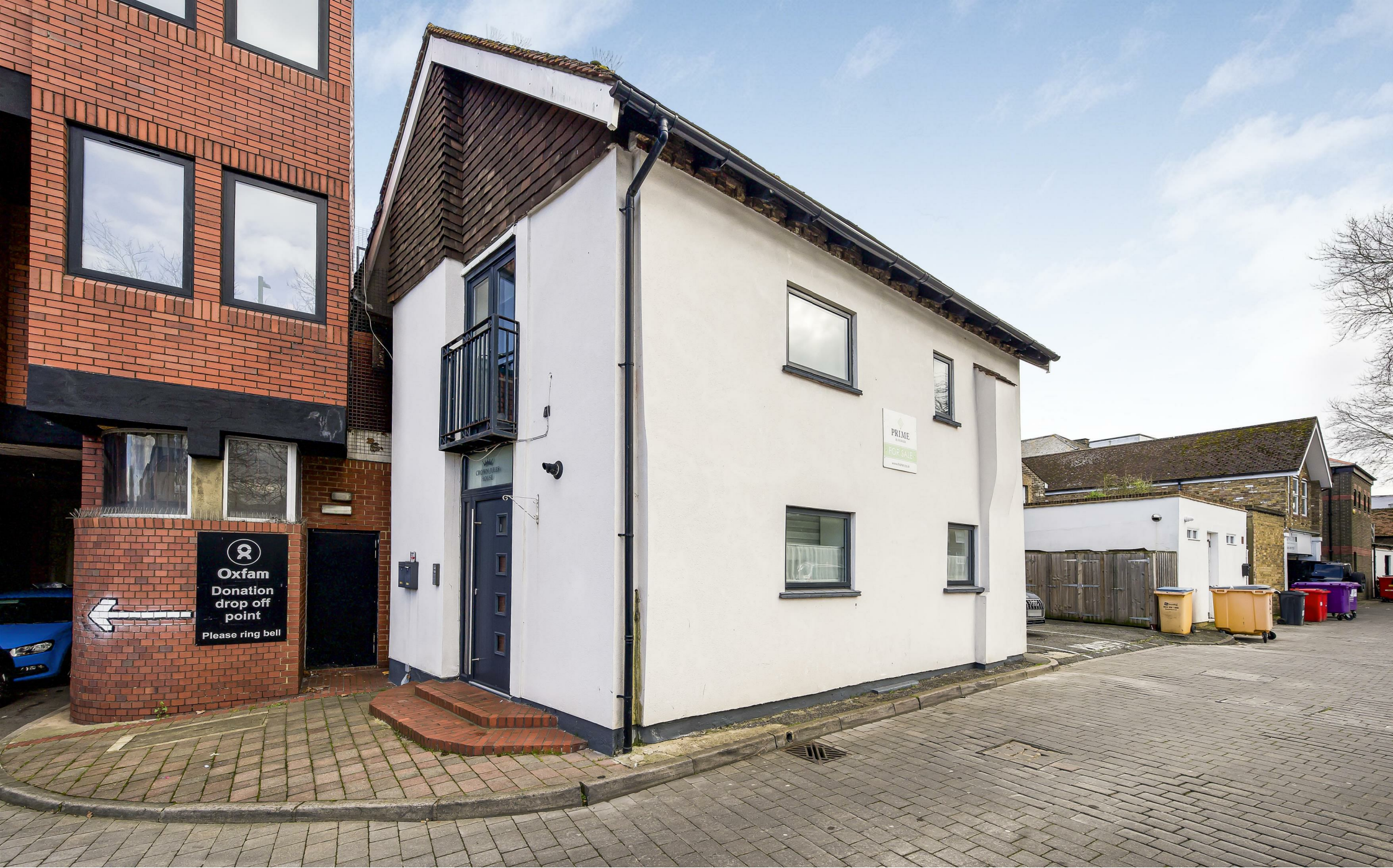
Apt 1, Crown Jules House Charles Street, Windsor, Berkshire, SL4 5DS £325,000