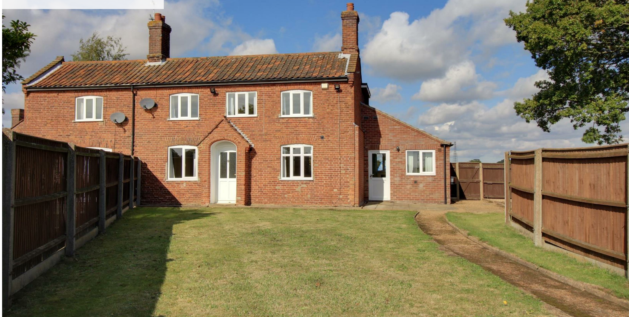
The Cottage, Harkers Lane, Swanton Morley, Dereham, NR20 4PA £1,100 PCM