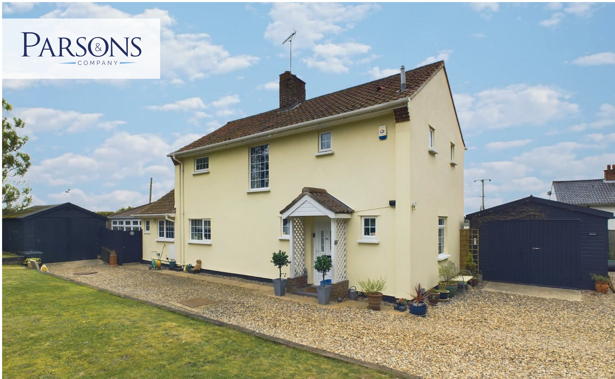
Waterworks House Bradenham Lane, Bradenham, Thetford, IP25 7QR £400,000