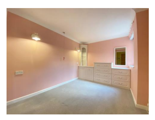
5 Chatham Court, Station Road, Warminster, Wiltshire, BA12 9LS