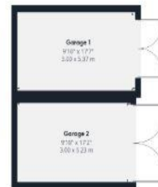
Ground Floor Building 4