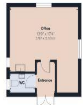
Ground Floor Building 5