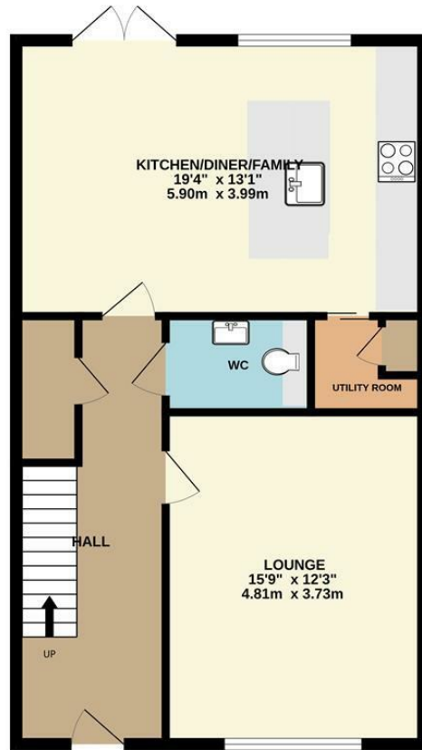
GROUND FLOOR 648 sq.ft. (60.2 sq.m.) approx.