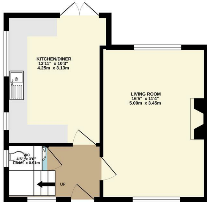
GROUND FLOOR 385 sq.ft. (35.8 sq.m.) approx.