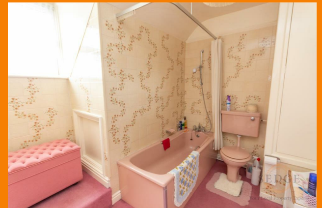
First Floor Approx. 45.9 sq. metres (494.4 sq. feet)