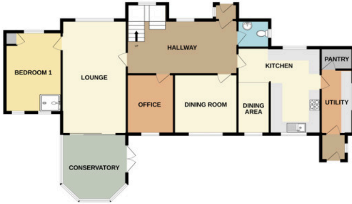
GROUND FLOOR 1382 sq.ft. (128.4 sq.m.) approx.