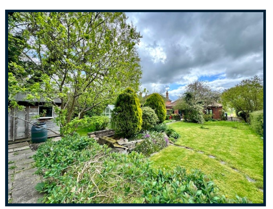
Church View Market Stainton Market Rasen LN8 5LJ