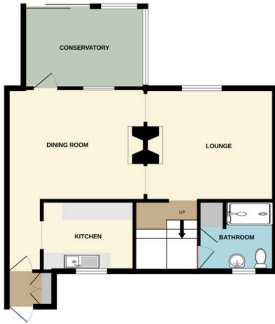
GROUND FLOOR 667 sq.ft. (62.0 sq.m.) approx.