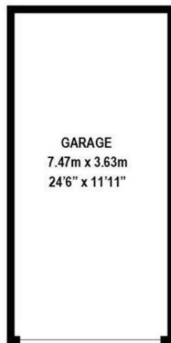
Approx. 27.2 sq. m / 293 sq. ft

TOTAL FLOOR AREA: Approx. 120.9 sq. m / 1,301 sq. ft