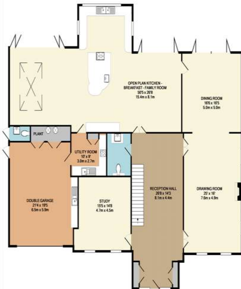
GROUND FLOOR APPROX. FLOOR AREA 2990 SQ. FT. (278.3 SQ. M.)