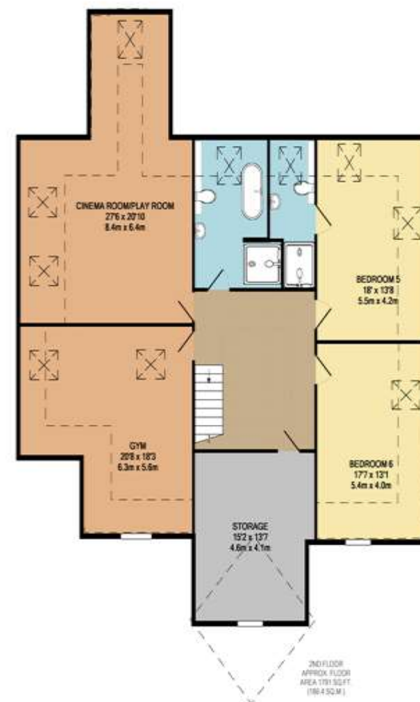
2ND FLOOR APPROX. FLOOR AREA 1791 SQ. FT. (166.4 SQ. M.)

TOTAL APPROX. FLOOR AREA 7010 SQ. FT. (651.5 SQ. M.) Made with Metagor 12/21/12