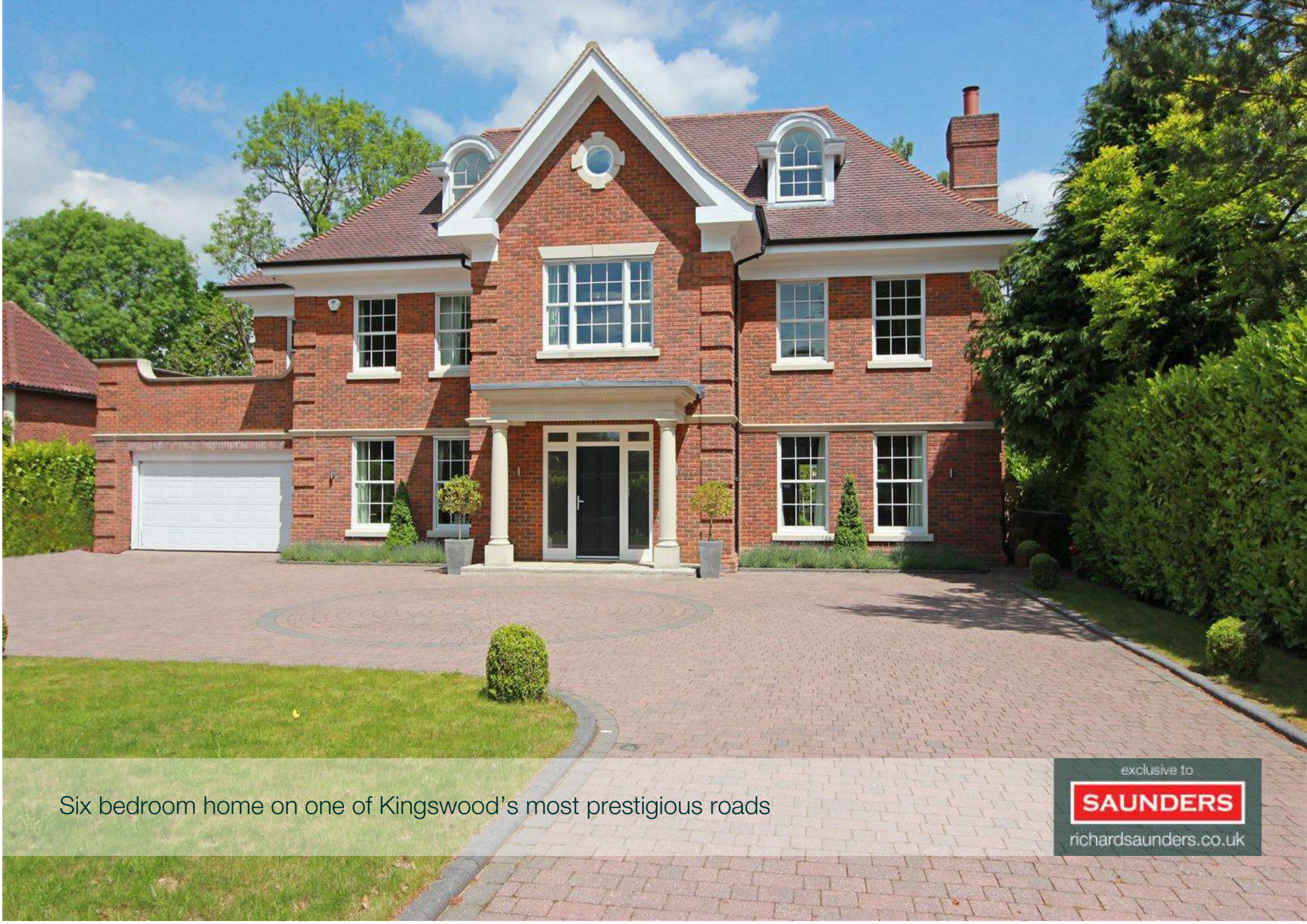
Six bedroom home on one of Kingswood's most prestigious roads