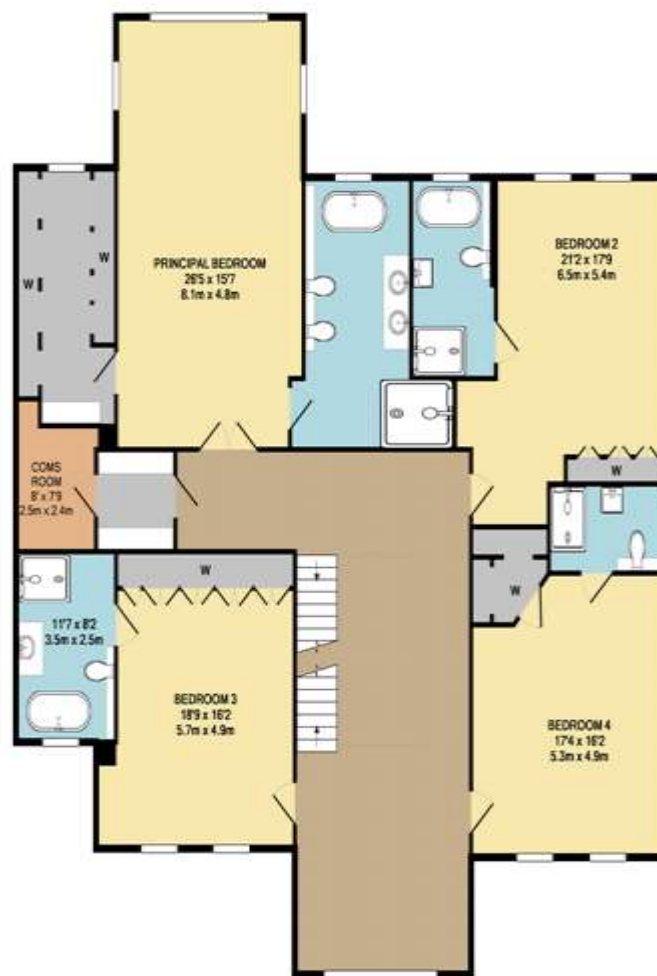
1ST FLOOR APPROX. FLOOR AREA 2201 SQ. FT. (204.6 SQ. M.)