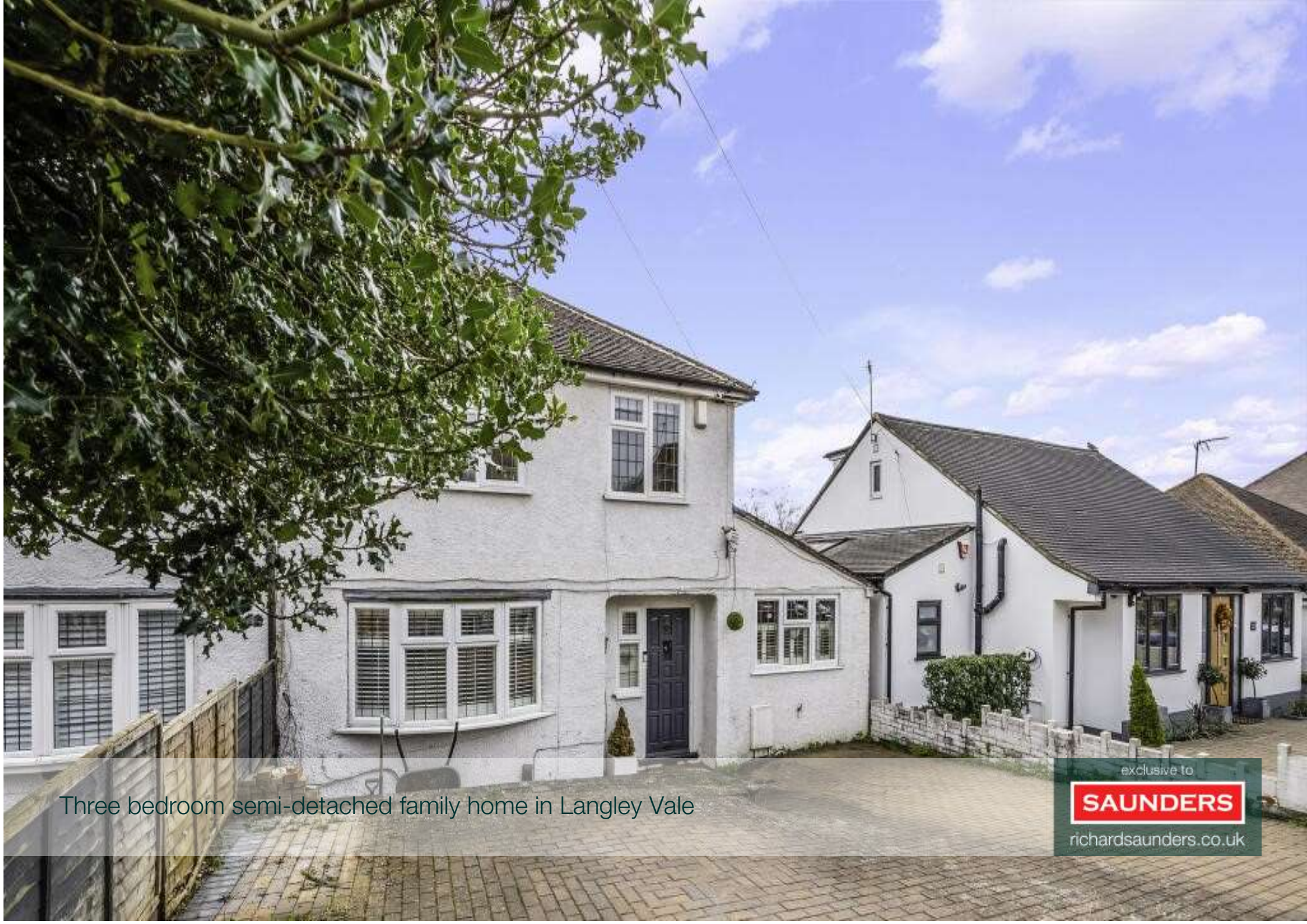
Three bedroom semi-detached family home in Langley Vale