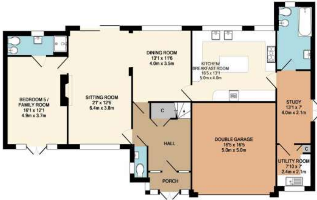
GROUND FLOOR: APPROX. FLOOR AREA 1542 SQ.FT. (143.3 SQ.M.)