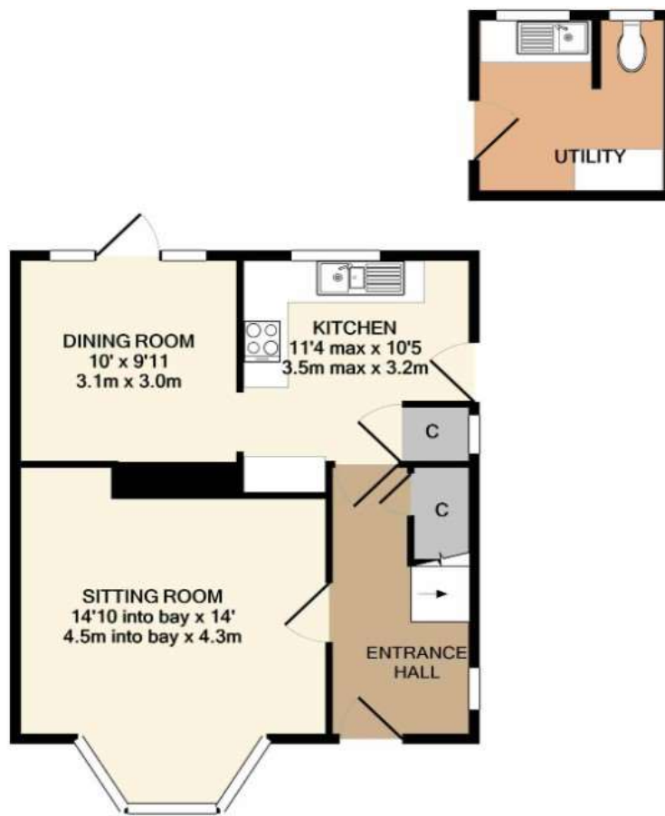
GROUND FLOOR APPROX. FLOOR AREA 551 SQ.FT. (51.2 SQ.M.)