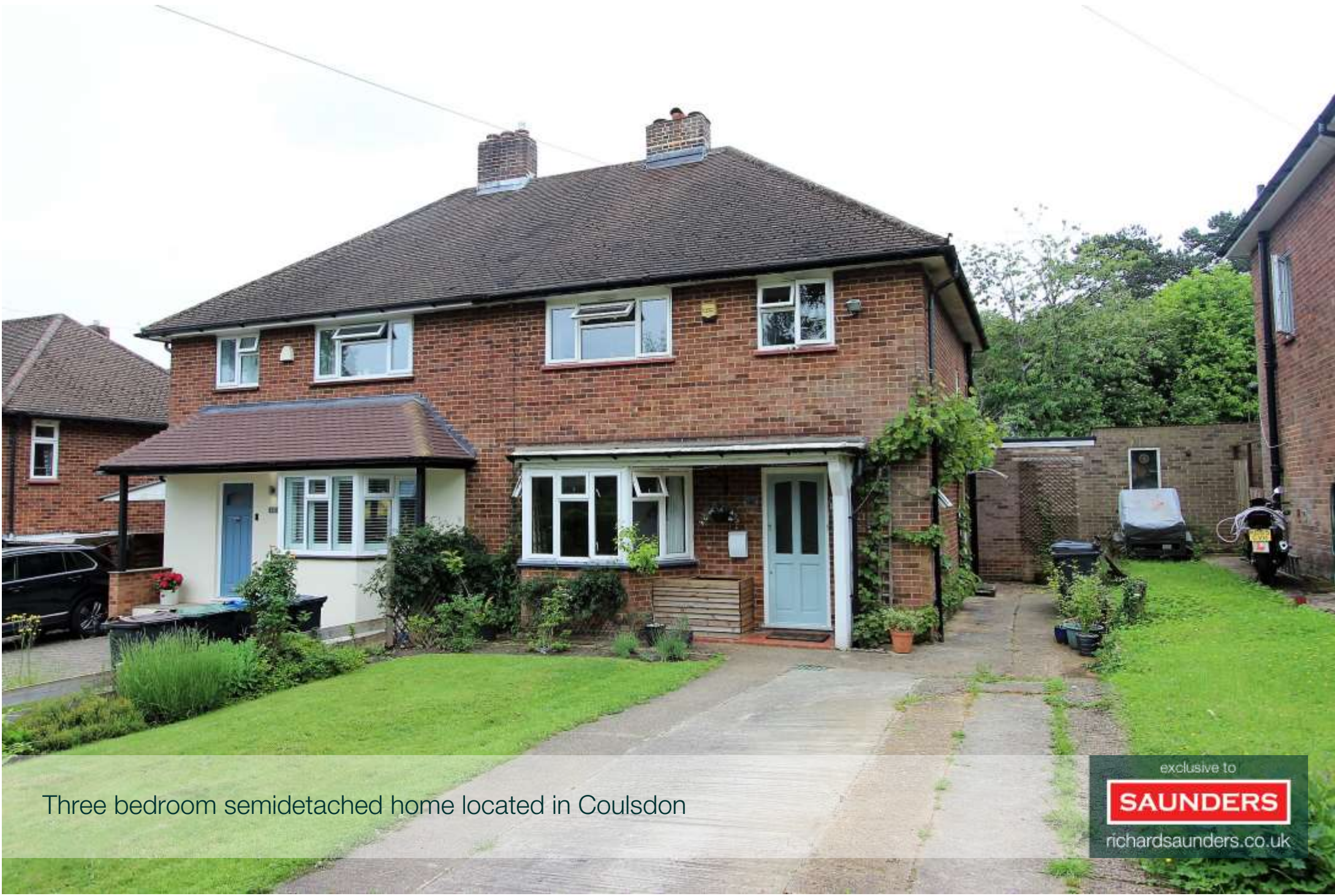
Three bedroom semidetached home located in Coulsdon

exclusive to SAUNDERS richardsaunders.co.uk