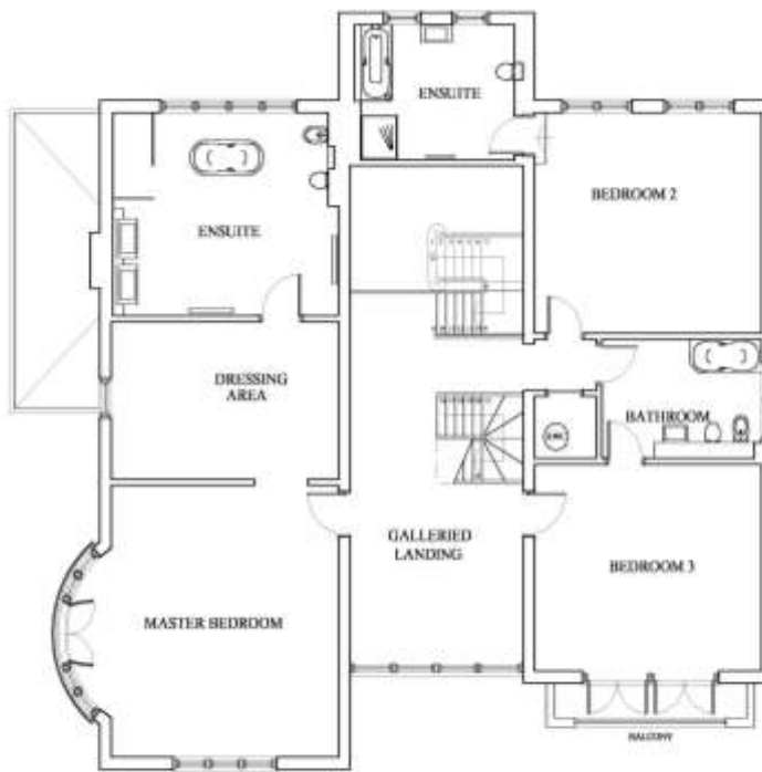
F FIRST FLOOR PLAN