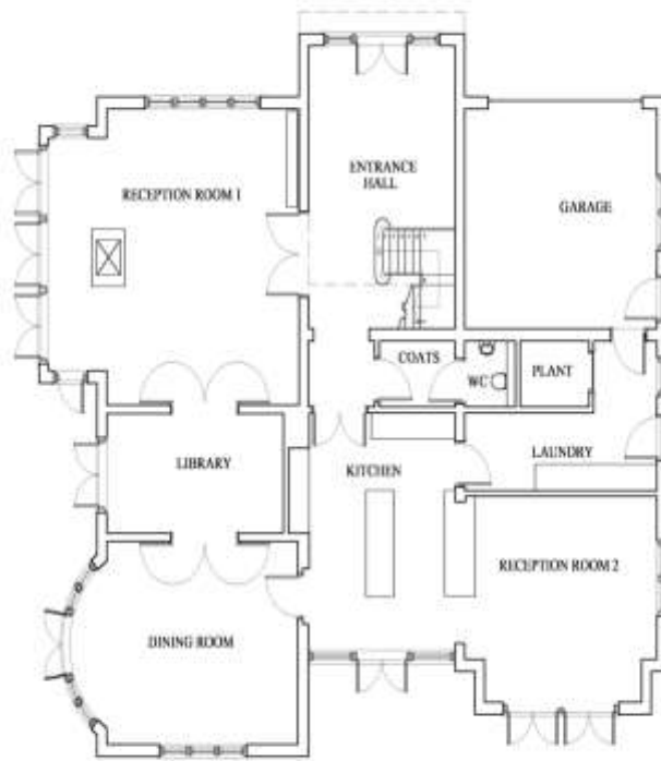
E GROUND FLOOR PLAN