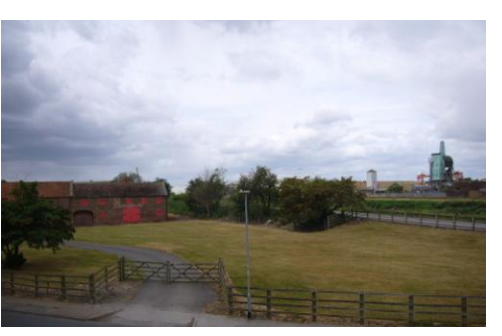
Apartment 6, Block 1, School Court Cottingham Street, Old Goole, DN14 5SJ