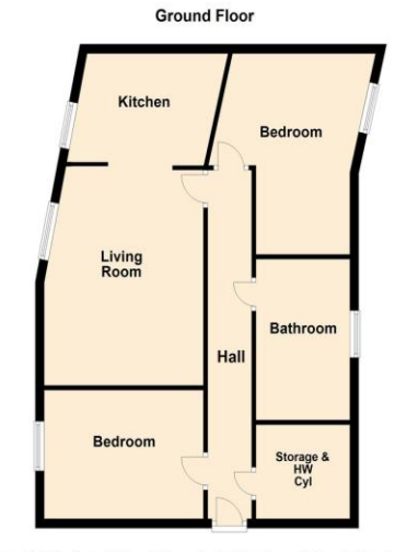
Apt.8 Block 1, School Court, Cottingham Street, Goole