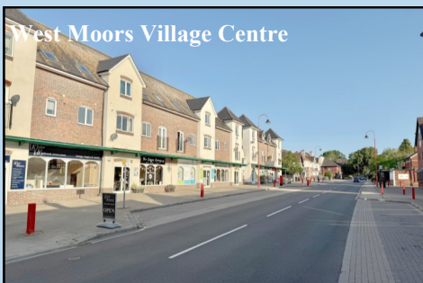
West Moors Village Centre